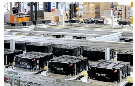
Fig. 1: EoL test track

Our entire production is carried out in Germany. With our unparalleled "end-of-line" test track (EoL, see Fig. 1), we test, inspect and cycle every battery cell and battery module before delivery. We thereby ensure that we always install and deliver "fresh" and 100% tested battery modules .